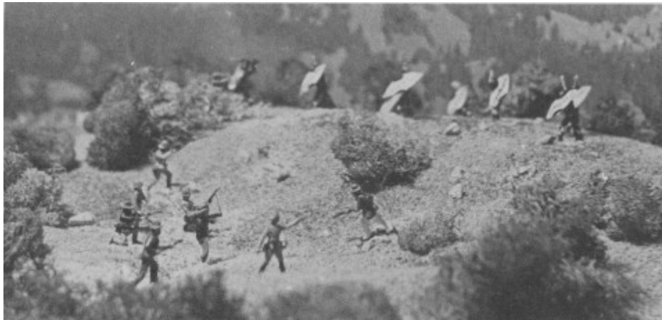
Zulus erupt over the crest of the hill hard on the heels of the English fugitives.