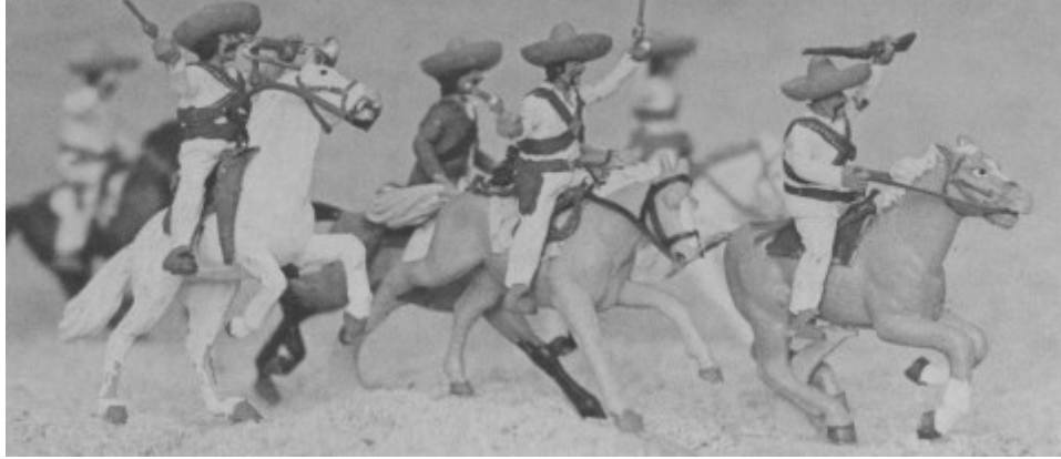
Mounted Mexican guerrillas in hot pursuit of Sergeant-Major's Legionnaires.