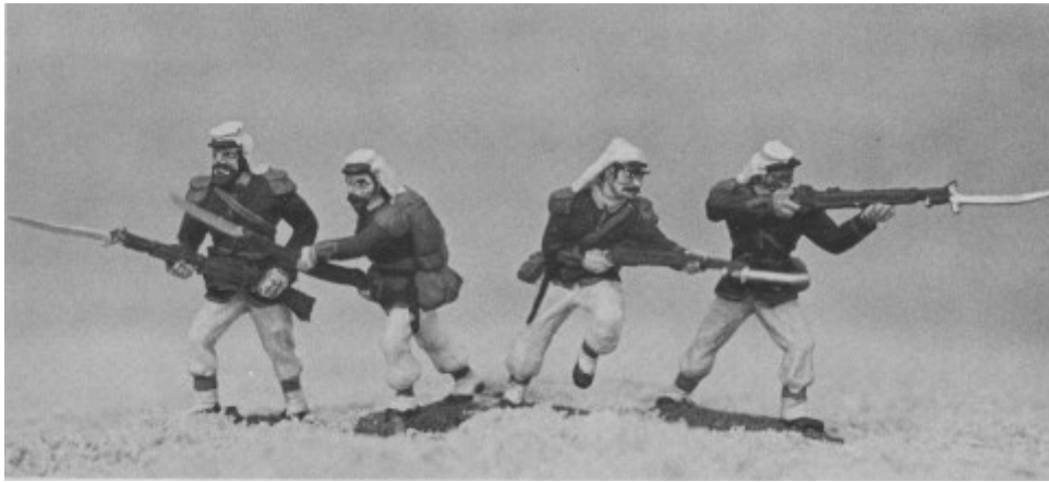
The legionnaires prepare for their final stand.